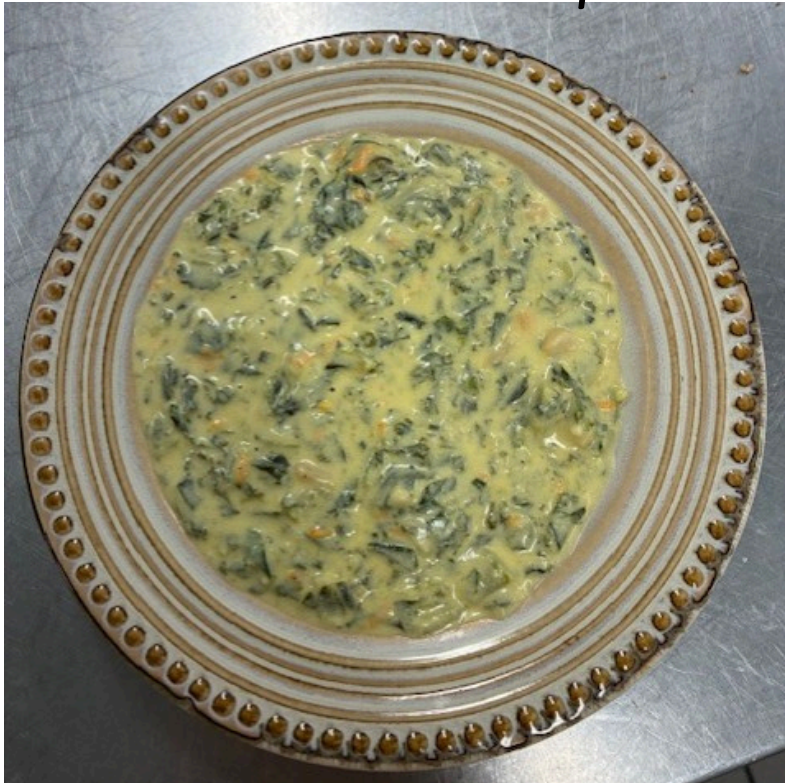
Cream of Spinach Kale Soup

The month of July for the kitchen unit focused on healthy side dishes. Due to excessive heat waves this month, the kitchen focused on providing healthy cold dishes loaded with vegetables.